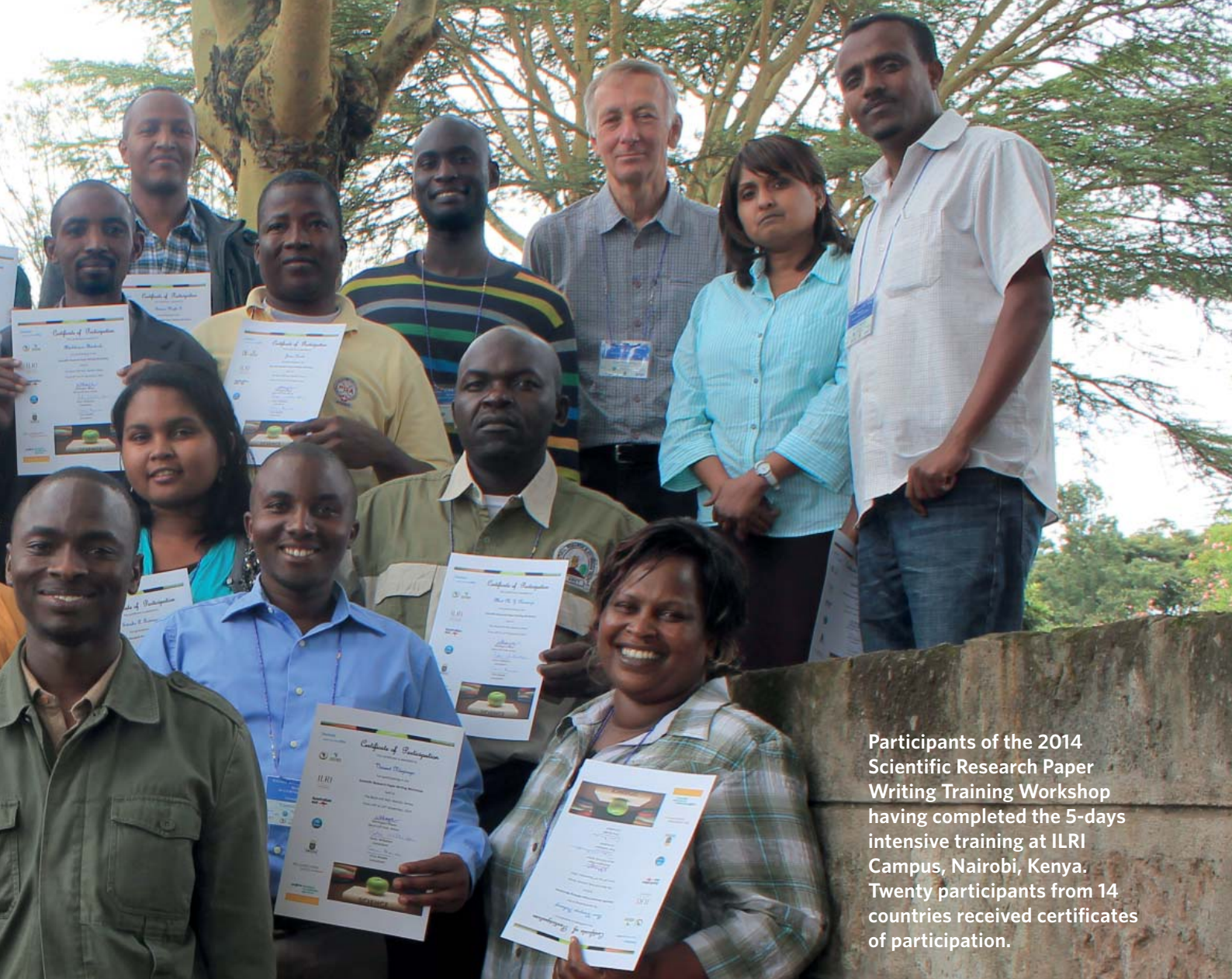
Participants of the 2014 Scientific Research Paper Writing Training Workshop having completed the 5-days intensive training at ILRI Campus, Nairobi, Kenya. Twenty participants from 14 countries received certificates of participation.